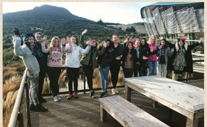
We enjoyed hosting International exchange students from Columba College.