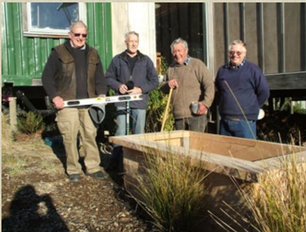
Blokes in Sheds constructed this edible garden bed - the first stage in our new nature play area.