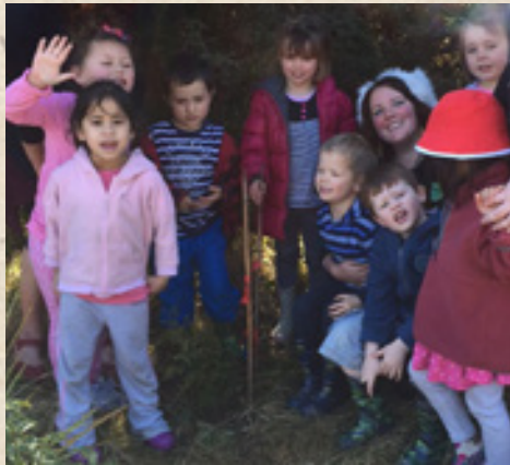
Tahu with Port Chalmers Kindy Eco Warriors.