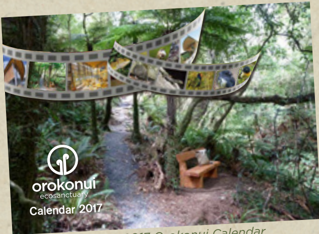
The beautiful new 2017 Orokonui Calendar

Another way you can support us is by purchasing gifts from our shop. Fresh from the printer are our fantastic 2017 calendars which feature the year's best photographs of beautiful Orokonui flora and fauna. See the Venue page of our website for on-line purchasing or better still come and visit us!