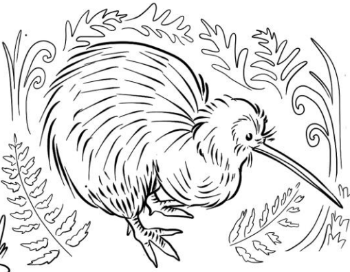
Haast tokoeka 2010