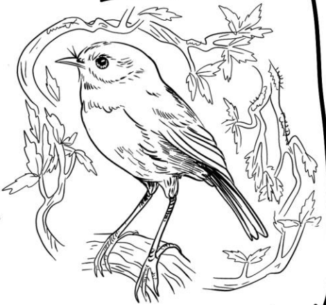
South Island Robin 2010