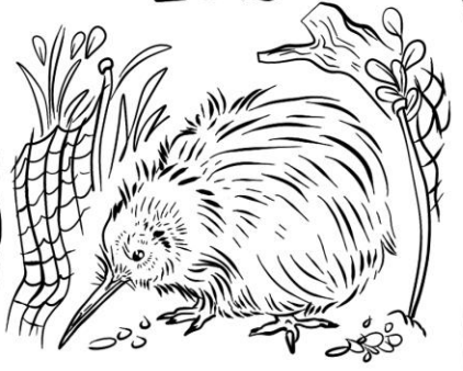
Kiwi Crèche 2015