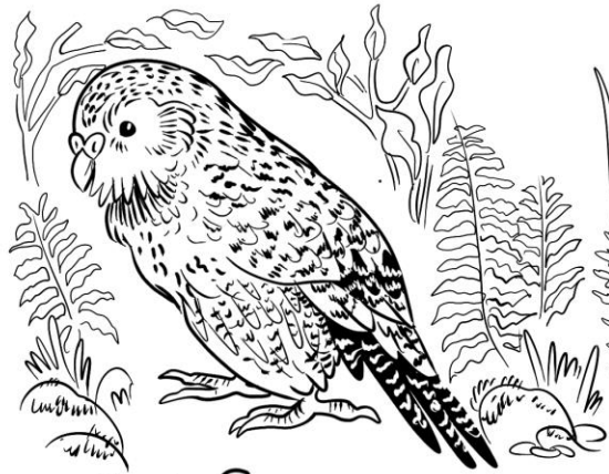
First Sirroco visit 2011