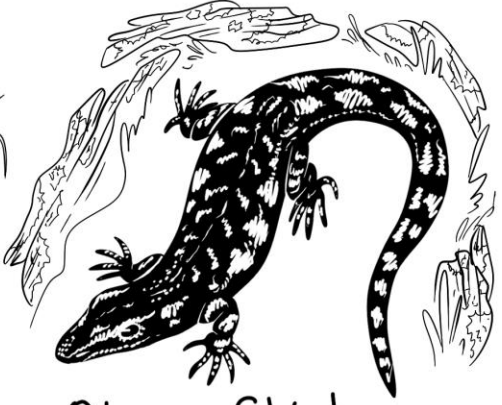
Otago Skink 2013