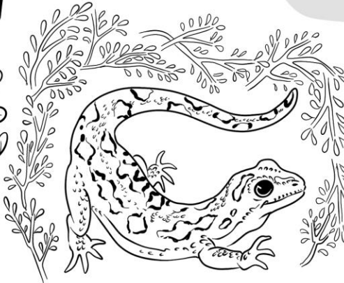
Jewelled Gecko 2009